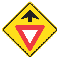
WB-2: yield ahead STOCK 75cm x 75cm