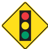
WB-4: signals ahead 60cm x 60cm, NOT STOCK 90x90, 120x120