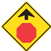
WB-1: stop ahead STOCK 75cm x 75cm NOT STOCK 120x120