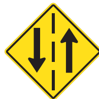
WB-3: two-way traffic ahead NOT STOCK 60cm x 60cm, 75x75